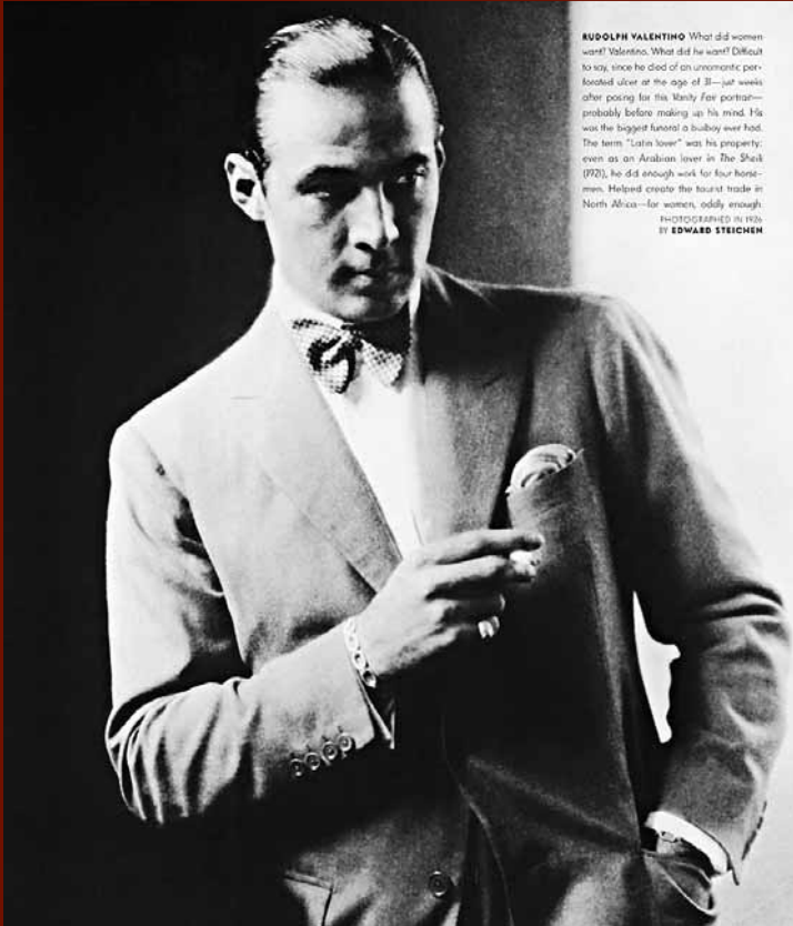
RUDOLPH VALENTINO What did women want? Valentino. What did he want? Difficult to say, since he died of an unromantic perforated ulcer at the age of 31—just weeks after posing for this Vanity Fair portrait—probably before making up his mind. He was the biggest funeral a bodyboy ever had. The term “Latin lover” was his property; even as an Arabian lover in The Sheik (1921), he did enough work for four horsemen. Helped create the tourist trade in North Africa—for women, oddly enough.

sun-dried tomato and sun-dried onions infused vodka, fresh cherry tomatoes, porto ruby, fresh lime juice, salt, pepper, lea and perrins worchester, tabasco